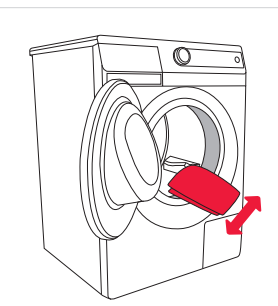
After each wash, wipe the rubber door gasket.