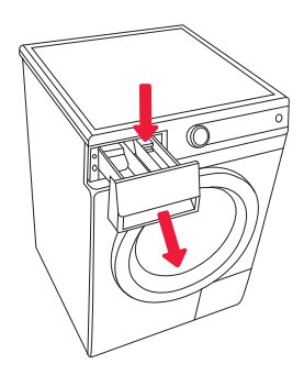
To remove the dispenser tray from the housing, press the small lever.