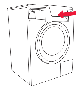
Replace the dispenser tray.