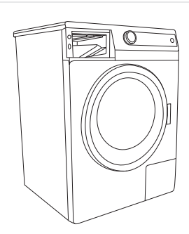
Before replacing the dispense tray, also clean the rinsing area.

CLEANING THE WASHING MACHINE RINSING AREA