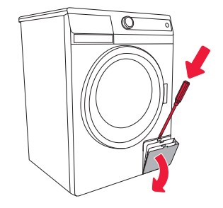
Open the filter lid using flat screwdriver or similar tool.

The filter must be occasionally replaced, especially after washing very old and fleecy or woolly laundry.